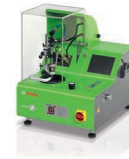
EPS 205: Quick and efficient work