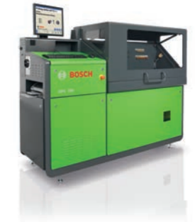
EPS 708: Specialised common rail testbench