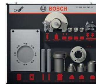
CP4 Tool board 1*

More than 125 years of expertise: next to competent service, Bosch provides you with high-quality tools for more efficient component repair.