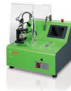
EPS 118: The injection tester for every workshop

Intuitive, precise and efficient: with Bosch as your partner you always have access to state-of-the-art and easy-to-learn test technology for the professional inspection of deinstalled diesel components.