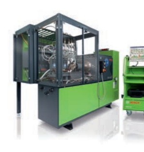
EPS 815, KMA 822, CRS 845 H: Universal diesel component testbench