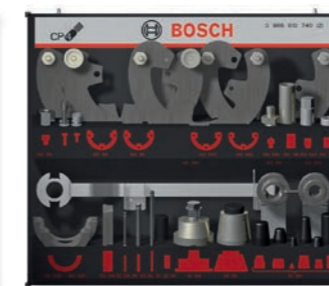
CP4 Tool board 2*